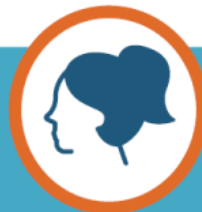
HAIR TIED BACK