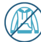
DRAW CORD CLOTHING